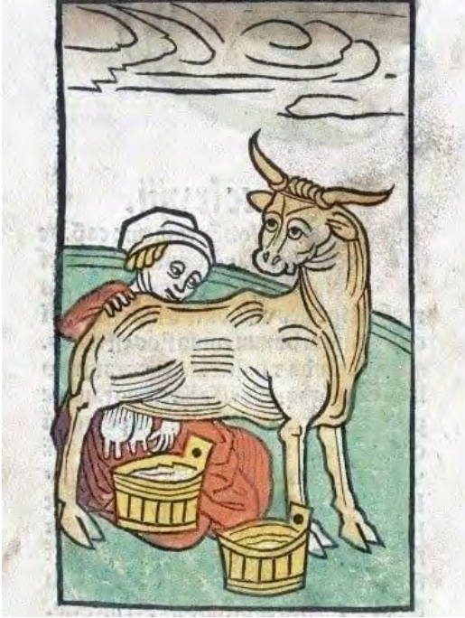
Woman milking a cow, woodcut, 1547

Jack in the Green come to me arms laden with violet and gold, take my hand and lead me onward back to the Spring again