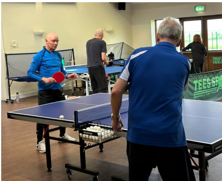
Coaching is a crucial aspect of achieving success at all levels of sport