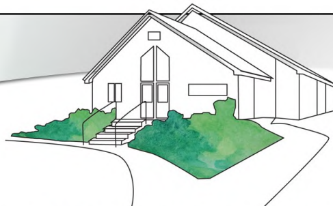
BISHOP WILTON VILLAGE HALL