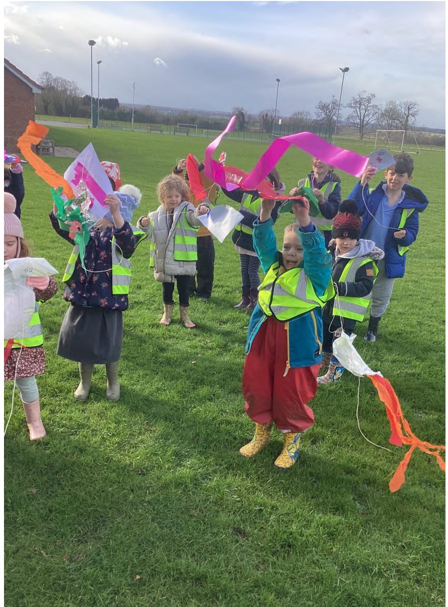
Children from Bishop Wilton School flying their kites on a blustery day!

Village Newsletter for Bishop Wilton and the Garrowby Parishes