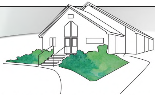
BISHOP WILTON VILLAGE HALL